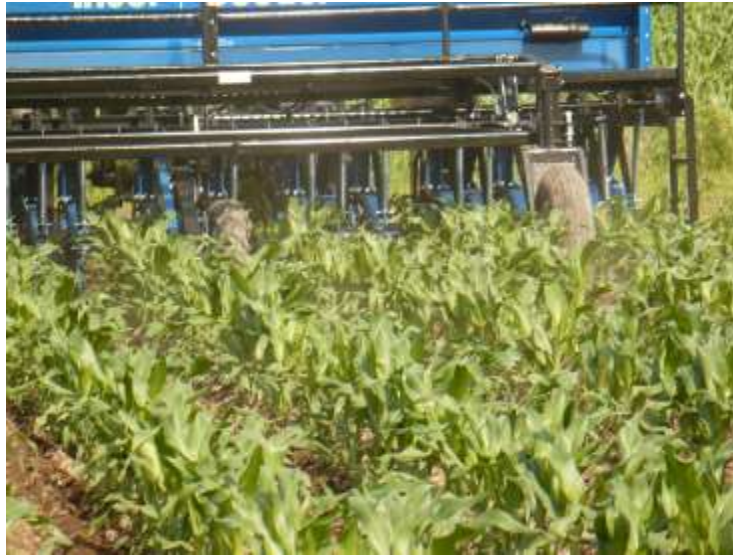
Figure 1. The Penn State Interseeder.