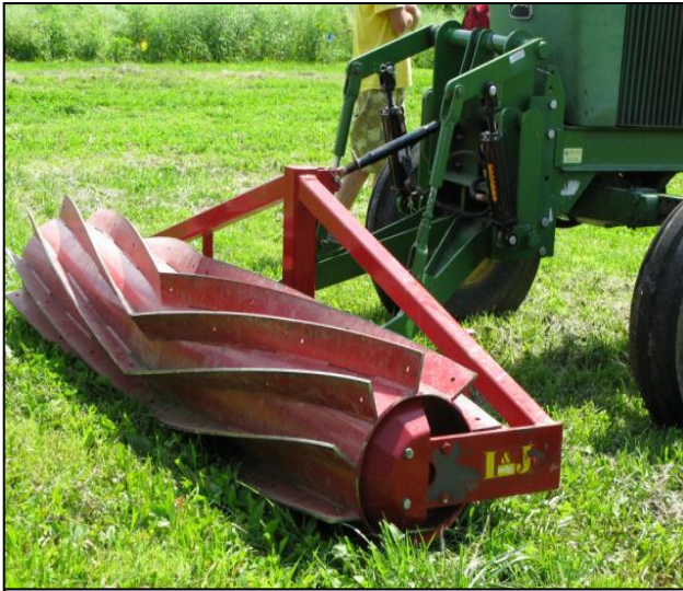
Figure 1. Roller crimper.

When a crop such as corn silage is harvested in the fall, the entire plant is removed leaving the soil exposed through the winter. These exposed soils are more prone to run-off and erosion of sediment and nutrients into surface waters. As a means to alleviate these issues, many farmers have started to plant