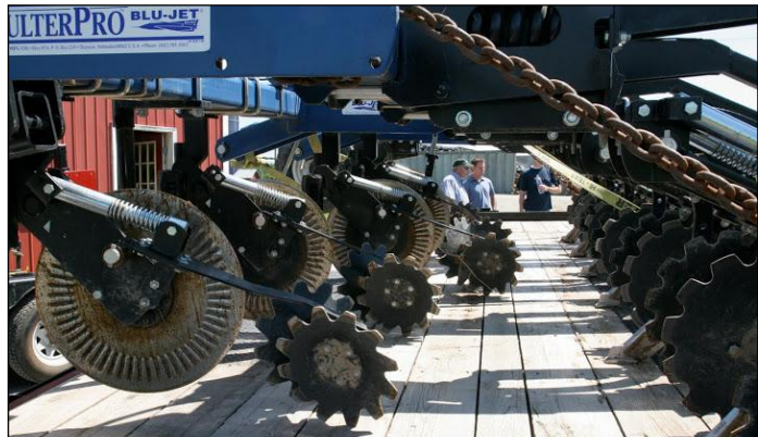
Figure 3. Blujet Coulter Pro used for strip-tillage.

Corn was planted on 10-Jun (var. Mycogen 2T108) at a rate of 36,000 seeds acre -1 . The no-till treatment was planted with a John Deere 1750 4-row planter, the zone-till treatment was planted with a White 6100 zone-till planter, and the strip-till treatment was strip tilled with a Blujet Coulter Pro (Figure 3) and planted with the no-till planter. Starter fertilizer was applied at a rate of 200 lbs of 10-20-20 to the acre in the no-till and strip-till treatments. The zone-till treatment had 5 gallons acre -1 of 9-18-9 applied as starter fertilizer. The strip-till treatment had an additional 15 gallons acre -1 10-34-0 and 10 gallons acre -1 32-0-0 UAN pre-plant fertilizer injected when the plots were strip tilled.