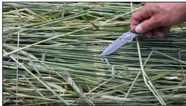
Figure 2. Rye cover crop that has been rolled and crimped.

In 2012, the University of Vermont Extension conducted the fourth year of an experiment to evaluate the impact of cover crop termination and reduced tillage strategies on soil health, soil nitrogen dynamics, and corn silage yield and quality. The goal is to document the positive and negative aspects of each strategy so farmers can decide the best way to terminate covercrops and implement reduced tillage on their farm.