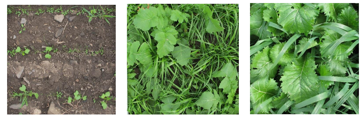
Image 1. Ground cover photos of contents in a 0.5m<sup>2</sup> quadrat from the 5-Oct (left), 15-Sep (middle), and 6-Sep (right) planting. Alburgh, VT, 2016.

The cover crop mixes planted on 5-Oct did not establish well enough to have biomass yield and height collected from it (Image 1). The 5-Oct planting date had an average percent ground cover of only 5.85%. Many of the cover crop species in the mixtures are winter terminated and early planting will be required to make sure adequate fall biomass is obtained prior to killing temperatures.