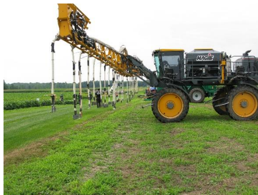
A few cover crop interseeder options include the InterSeeder (left) and highboy high clearance seeder (right).