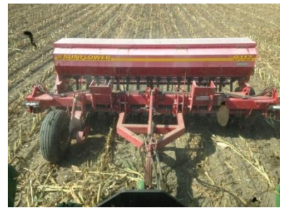
Reduced tillage planter options range from modified corn planter on left to drills on right (for perennial hay and pasture).