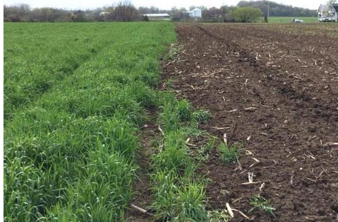
Reduced (left) vs conventional tillage. We need to change our way of thinking so we choose the field on the left over the field on the right.

One of the most important factors in looking at any new practice—including reduced tillage and cover cropping—is attitude. In the past, there has been a general mindset that “no-till = no yield.” It takes a different way of thinking to move from this opinion and from conventional to reduced tillage, so your attitude towards managing risks will need to change accordingly.