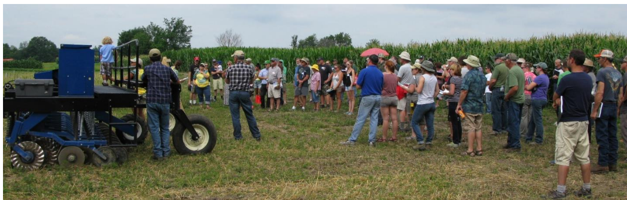
Events like the annual UVM Extension Northwest Crops and Soils Field Day provide opportunities to see equipment, learn the latest research findings, and meet other farmers.