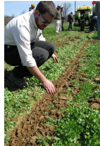
Demonstration of a roller-crimper and no-till planter.

Start small by conducting your own on-farm research, using check strips and trials to figure out what works on your farm. By conducting your own test plots and building off the successes and failures of others, you will gain knowledge, experience and confidence to transition your farm to a reduced tillage system. Don’t forget to track results so that you build on and celebrate your own successes and remain committed to your goals.