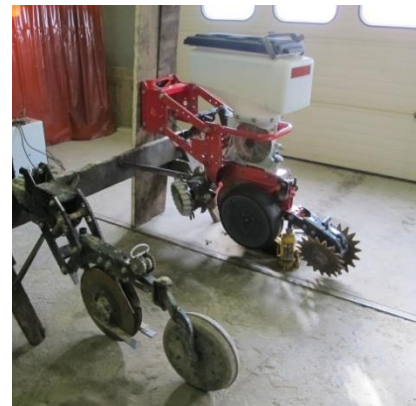
Examples of no-till planter modifications.